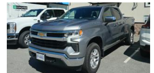
BC Plate XP 4460

Watch for survey crews making frequent stops between the hours of 7:00 a.m. to 6:00 p.m. across the region from June 15 th to June 26 th .