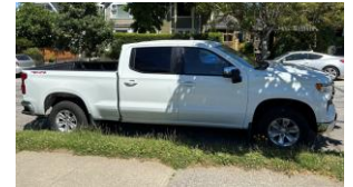
BC Plate XN 3725

To complete an ALI, Professional Agrologists and GIS technicians perform visual observations to help confirm mapped crops, irrigation, natural vegetation, buildings, livestock facilities, and farm practices within the ALR and parcels where significant farming is observable.