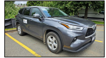
BC Licence Plate SL2 47B

AgriServiceBC 1-888-221-7141 agriservicebc@gov.bc.ca