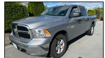
BC Licence Plate VS 0670

Agricultural Land Use Inventory data will provide insight into the current state of farmland and enable observation of future changes. The data may be used to: