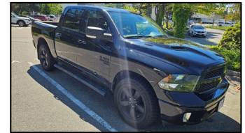
BC Licence Plate SN 0816