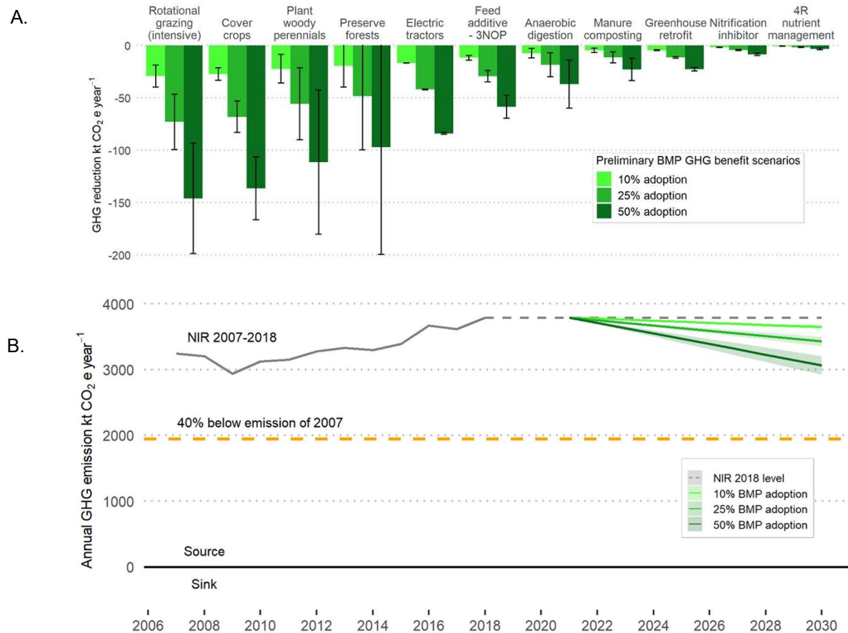
FIGURE 3. GREENHOUSE GAS BENEFIT POTENTIAL OF THE PRELIMINARY SET OF BENEFICIAL MANAGEMENT PRACTICES (A) BY INDIVIDUAL BMP AND ADOPTION RATE AND (B) BY COMBINED PROJECTED EMISSION REDUCTIONS BASED ON THREE ADOPTION LEVELS ACHIEVED BY 2030 RELATIVE TO EMISSIONS IN 2018.

Figure 3 shows our estimates of the GHG benefit of implementing our preliminary set of BMPs at different levels of adoption by 2030 (10%, 25%, and 50%) to evaluate their potential contribution to BC’s target of a 40% overall reduction by 2030 from a 2007 baseline. Compared to 2018 emissions this would require a reduction of -1,849 kt CO 2 e per year. Assuming a “high” adoption level of 50% for all the BMPs included in this analysis (Figure 3A), we estimate this would result in an annual GHG reduction of -718 (± 132) kt CO 2 e per year, which is only a 5% reduction in emissions relative to 2007 (Figure 3B). In comparison, a more achievable adoption level of 25% results in GHG benefits are estimated as -359 (± 66) kt CO 2 e per year which would nearly offset the increase in emissions since 2007. In these coarse-level preliminary estimates, most GHG benefit potential is driven by potentially large carbon sinks in soils and vegetation from rotational grazing, cover crops, and tree-planting near riparian waterways, all of which have important co-benefits.