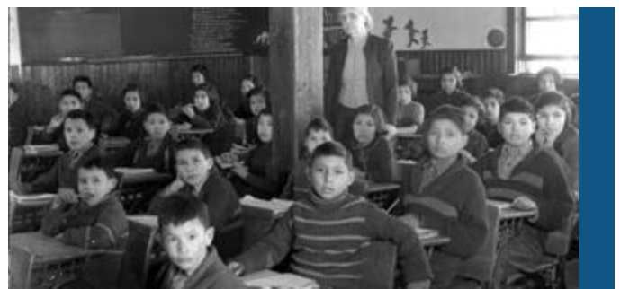
Cree students at their desks with their teacher in a classroom, All Saints Indian Residential School, Lac La Ronge, Saskatchewan, March 1945