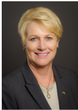
HONOURABLE KATRINE CONROY MINISTER OF CHILDREN AND FAMILY DEVELOPMENT