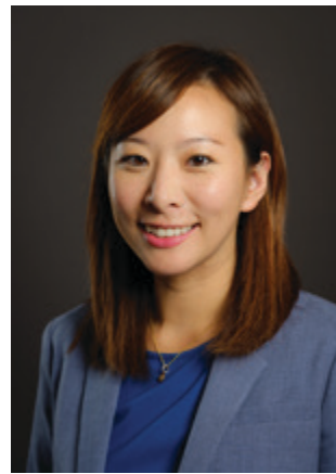
HONOURABLE KATRINA CHEN MINISTER OF STATE FOR CHILD CARE