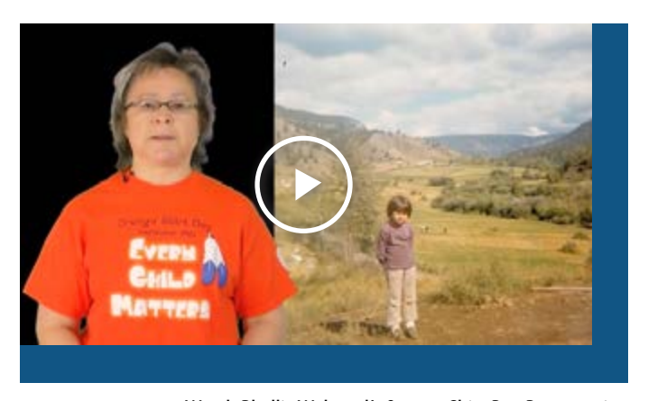
Watch Phyllis Webstad's Orange Shirt Day Presentation www.youtube.com/watch?v=E3vUqr01kAk&feature=youtu.be

http://projectofheart.ca//wp-content/uploads/2012/08/They-Came-for-the-Children.pdf