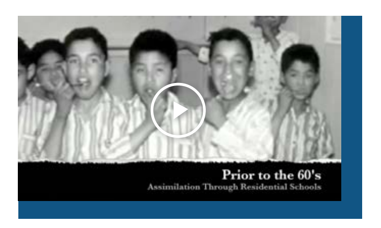
Informative Video on the Sixties Scoop and its legacy https://youtu.be/kH bdIYNnFU

https://www.cbc.ca/cbcdocspov/features/the-sixties-scoop-explained