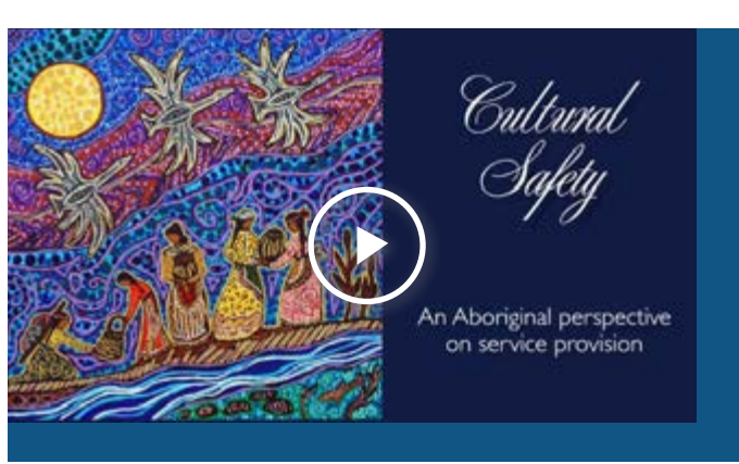
Video: Learning about cultural safety from Indigenous Elders (Wabano Health Centre)

Cultural Safety in Practice with Children, Families and Communities Indigenous Cultural Safety Learning Series Cultural Safety in First Nations, Inuit, and Métis Public Health What is Indigenous Cultural Safety - and Why Should I Care About It? Cultural Safety - University of Victoria BC Government Indigenous Relations Behavioral Competencies