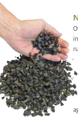
Scrap tires are processed into crumb rubber.