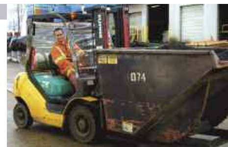
Crumb rubber processing plant

BC companies process scrap tires to be used for tire-derived products or fuel supplements as well as sell tire-derived products to markets in Canada and the US. They submit claims to TSBC for transportation and processing incentives.