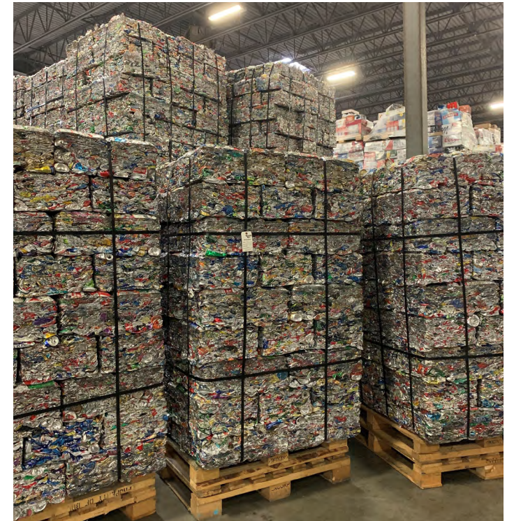
Cans are crushed before shipping to optimize transportation routes and to reduce need for trucks on the road.

tonne of aluminum recycled, over 200 GJ of energy are saved in avoided production processes including: bauxite mining, alumina refining, and electrolysis 2 .