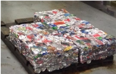
Cans are crushed before shipping to optimize transportation routes and to reduce need for trucks on the road

The number of refillable glass bottles shipped to brewers for re-use is tracked and recorded by BDL, as well as the weight of broken or culled glass shipped directly to glass recyclers. BDL's records also include the weights of aluminum cans that are crushed into "biscuits" and shipped to aluminum recyclers. In 2020, 100% of the aluminum and glass containers sent from BDL to recyclers was recycled. By reusing and recycling containers and packaging, then releasing the containers back into the market, brewers maintain their commitment to the environment and ensure that the recycling operations done by BDL are utilized to the fullest. Table 3 shows the results for the materials recovered in 2020.