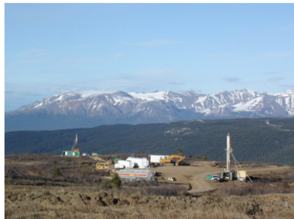
Figure 1- Red Chris gold and copper mine (MEM 2014)

Please refer to Appendix 1 for more information on legislation that is relevant to this audit.