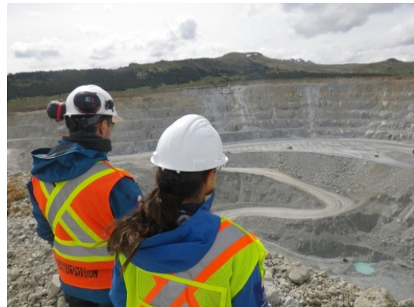
Figure 3- Environment Protection Officer in the field

Compliance was determined through a thorough examination of each authorization's Qualified Professional conditions. Office reviews were completed by an Environmental Protection Officer. Each authorization that was assessed during the audit has a corresponding inspection report that lists the Qualified Professional conditions that were assessed, the compliance determination of the conditions (i.e. whether or not the authorization holder was in compliance) and any compliance/enforcement responses. The final inspection reports were then shared with the appropriate facility owners/operators.