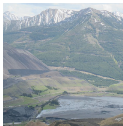
Figure 2- Fording River Mine (MEM 2014)