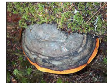
Brown crumbly rot, serious on dead trees ( Fomitopsis pinicola )