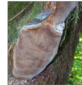
White trunk rot ( Phellinus hartigii ) conk, also on stem, wind failure risk