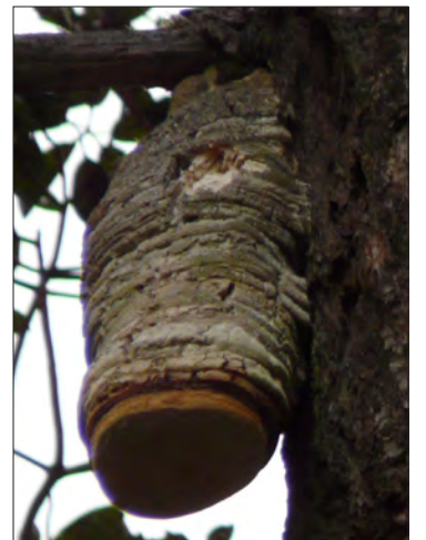
Brown trunk rot ( Fomitopsis officinalis )