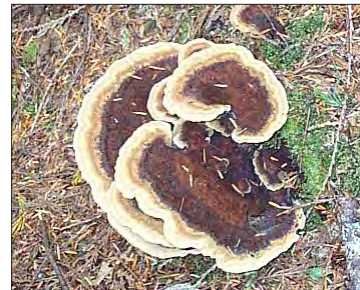
Butt rot ( Phaeolus schweinitzii ) conks can be on the ground or on tree