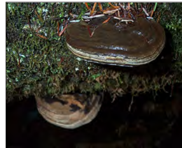
White mottled rot ( Ganoderma applanatum ) conk