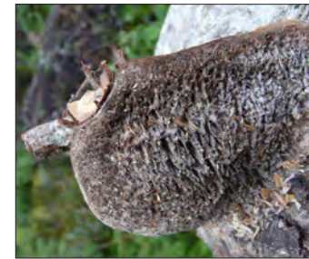
Brown stringy trunk rot a.k.a Indian paint fungus (Echinodontium tinctorium) look for them at branch stubbs

Thick sloughing bark – for thick barked species (especially Douglas-fir, Larch, Cottonwood), consider loose slabs shedding from the stem.