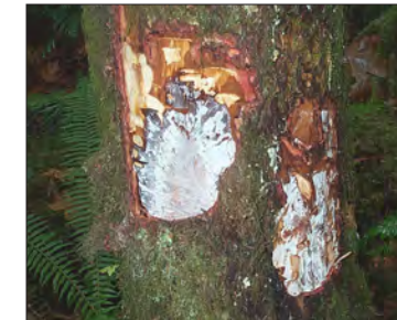
Armillaria root disease confirmed by white mycelial fan under bark