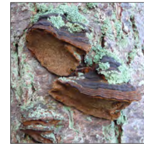
Red ring rot conk ( Porodaedalea pini )