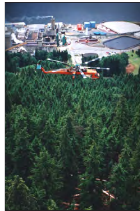
Heli-logging with ground crew is LOD-4

Activities that are considered to cause very high levels of disturbance (LOD-4) include: