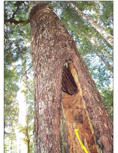
Stem damage with obvious signs of advanced decay - bore for shell thickness

Root damage – if more than 25% of the major support roots are torn, rotten or lifted then the tree is dangerously unstable.