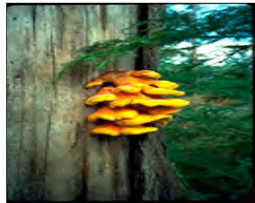
Brown cubical rot ( Laetiporus conifericola )