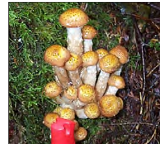
Armillaria root disease mushrooms, also found on tree's stem