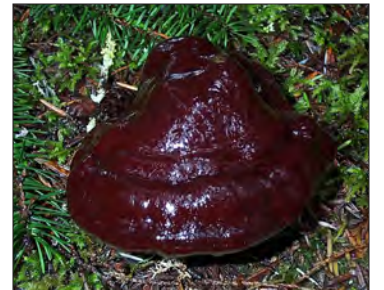
Lacquer fungus ( Ganoderma oregonense ) conk