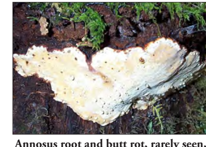
Annosus root and butt rot, rarely seen, found under root flares ( Heterobasidion occidentale )