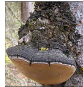
Aspen trunk rot ( Phellinus tremulae )

There is a high risk that defect trees will fail under very high levels of disturbance (LOD-4), and for this reason, most trees with structural defects are dangerous for LOD-4. The exceptions are cedars. To be considered safe, however, a defect cedar can only have superficial damage with no evidence of decay in the surrounding stem wood. Roots must have no visual stability problems, and damage can affect no more than 25% of the support roots. Lean must be minimal with no sign of rooting problems (disease, damage, lifting mat, or unstable soils). If these conditions are not met, the cedar tree is dangerous.