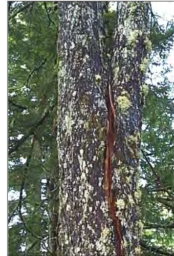
Split trunk with advanced rot

Split trunk – deep cracks (extending >25% of tree diameter into stem) with internal decay.