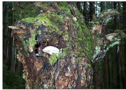
Mistletoe stem goiter with heart rot conk

Hazard top – dead tops and secondary tops are particularly dangerous where there are visual signs of weakness (e.g., splits, cavities, shrubs growing out of forks, conks, signs of advanced rot). Snags with weak tops are also dangerous where >20% of the tree height is an unstable top (30% for Douglas-fir, spruce, pine or larch).