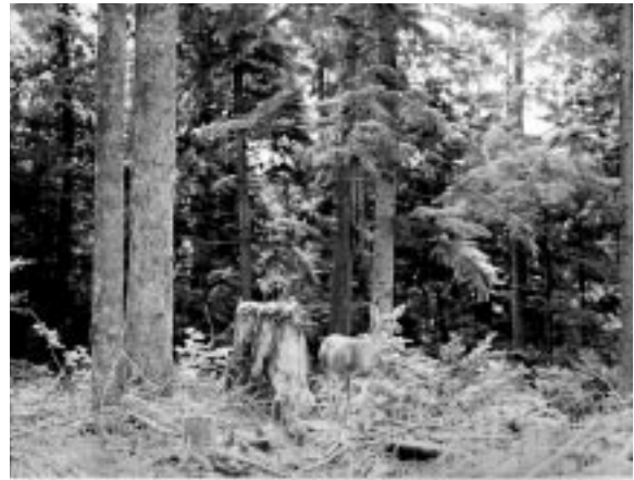
BLACK-TAILED DEER OCCUR ALONG THE ENTIRE COAST OF BC AND MAKE FREQUENT USE OF LOGGED HABITATS DURING SPRING AND SUMMER.

Early explorers in British Columbia depended on deer for survival. They killed many in order to provision trading posts and also exported deer