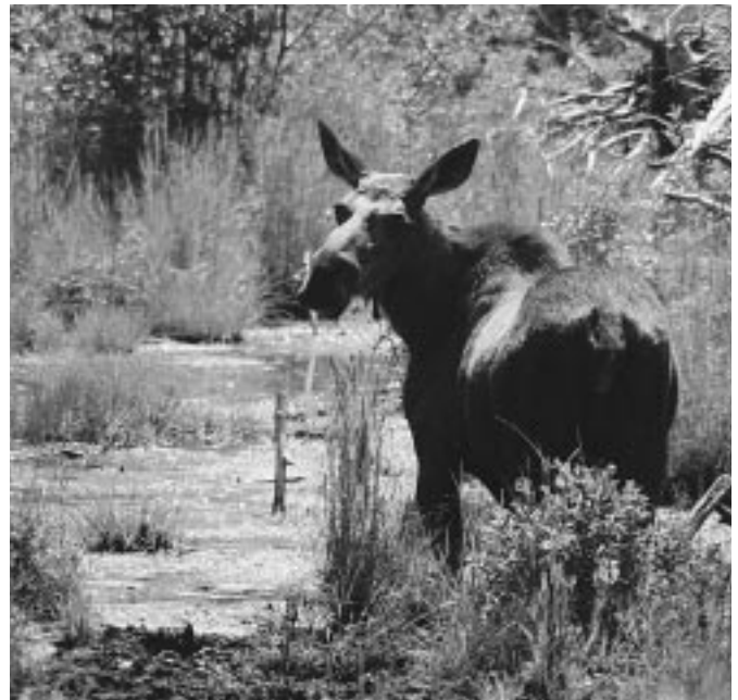
DURING SUMMER, MOOSE ARE OFTEN SEEN FEEDING ALONG LAKE SHORES, SWAMPS AND BEAVER PONDS. L.R. Ramsay

Many outdoor recreationists have been thrilled at spotting a mature bull or cow with its calf in a natural setting.