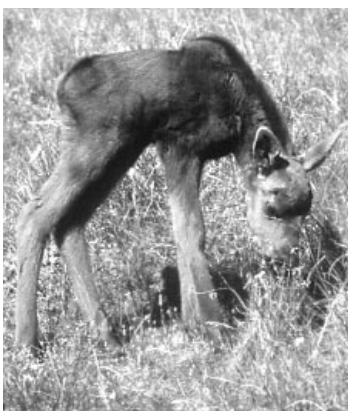
UNDER NORMAL CONDITIONS, SINGLE BIRTHS ARE THE RULE ALTHOUGH TWIN CALVES ARE NOT UNCOMMON. BC Gov.

Moose are better adapted to a diet of coarse woody browse than are other hoofed animals within their range.