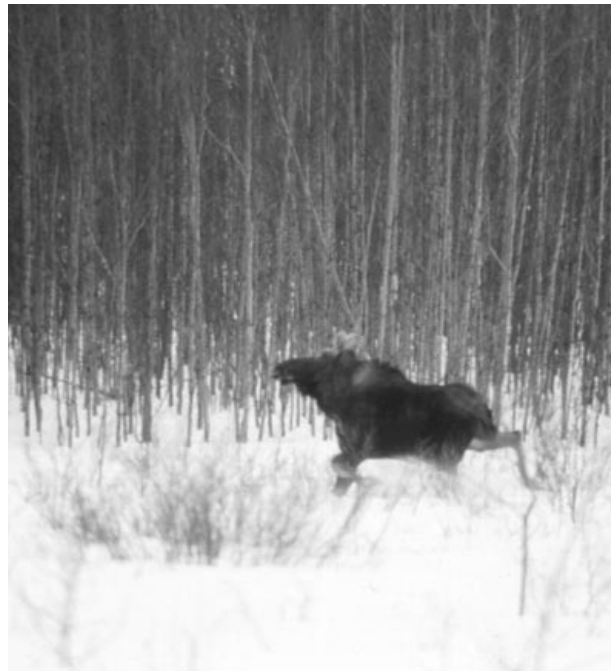
MOOSE ARE WELL ADAPTED TO SNOWY REGIONS BECAUSE OF THEIR LONG LEGS, WHICH HELP THEM TRAVEL THROUGH DEEP SNOW. BC Gov.

In future, increasing human populations and resource development in central and northern British Columbia could have adverse effects on Moose habitat. It will require comprehensive land-use planning to ensure that these developments have as little impact as possible on Moose populations. Carefully considered approaches to land-use planning, forest practices, and habitat enhancement can help maintain today's Moose populations well into the future.