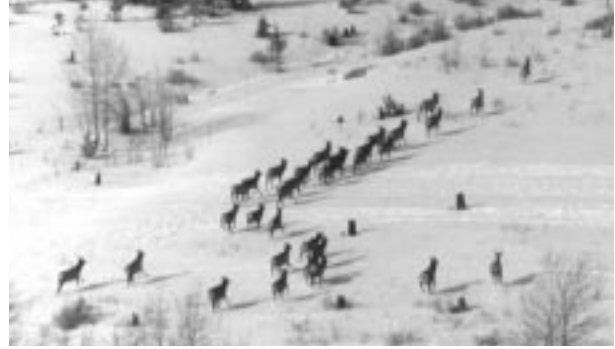
ELK OCCUPY A VARIETY OF HABITATS, BUT GENERALLY ARE CONFINED TO REGIONS WHERE SNOW DEPTH ON WINTER RANGE IS SHALLOW.

Elk conservation programs have a long history in the province. The early 1900s saw the initiation of measures such as closed or restricted hunting seasons, game reserves, and introduced Elk. The desire to protect Elk and other wildlife led to the establishment of Yoho and Kootenay national parks in 1886 and 1920 and Strathcona Provincial Park in 1911. Recent government initiatives such as the Protected Areas Strategy have produced new reserves that contain Elk, particularly in the northern Rockies. Elk transfers and reintroductions began in 1917 with the release of 10 animals near Lillooet. Since that time the release of over 600 Elk at numerous sites has resulted in several new herds and a wider distribution of Elk in the province. The Manitoba Elk was introduced twice: once in 1948 to the Lardeau River valley in the west Kootenays, and again in 1984 to the Kechika River valley in the northern Rocky Mountains. Sports groups have helped government agencies with many of the Elk transplants. There are more release sites capable of supporting Elk, but some are subject to potential conflicts between Elk and agriculture. There appear to be a number of sites on the southern mainland coast where Roosevelt Elk could establish themselves. In 1998, Roosevelt Elk was added to the Blue List of vulnerable or sensitive species because of its limited range and abundance and concerns about loss of habitat, predation, poaching, and unregulated hunting.