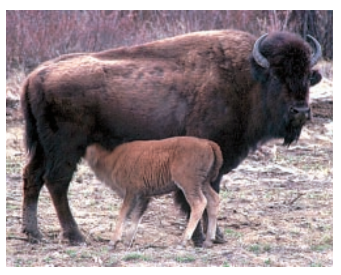
FOR THE FIRST THREE MONTHS OF LIFE, YOUNG BISON ARE REDDISH BROWN.

The first attempt to reintroduce Wood Bison near Etthithun Lake was abandoned after the formerly captive