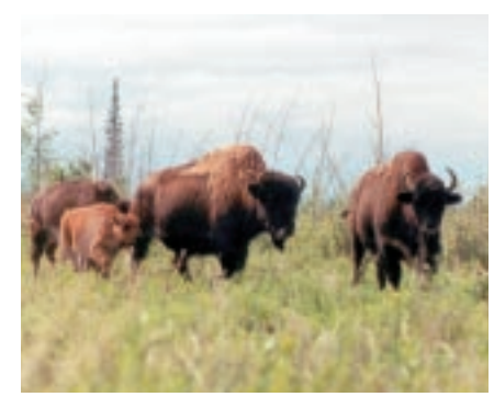
A MIXED AGE COW-CALF GROUP IN SHRUBBY HABITAT.

for natural fire regimes to improve the quantity and quality of bison feeding habitats. Although industrial development may have negative impacts on bison habitat, rehabilitation by industrial concerns has provided increased grass production in some localized areas of the northeast. Reintroduction programs may be able to take advantage of these practices.