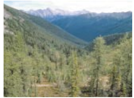
THIS UNDEVELOPED VALLEY USED BY MOUNTAIN CARIBOU HAS OLD-GROWTH HABITAT EXTENDING FROM SUBALPINE TO VALLEY BOTTOM.

caribou winter range and for snowmobile riding can allow these two uses to co-exist. A continued moratorium on hunting of Mountain Caribou will prevent some direct losses.