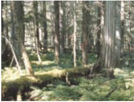
LOW ELEVATION CEDAR-HEMLOCK FOREST IS USED AS EARLY WINTER RANGE BY MOUNTAIN CARIBOU.