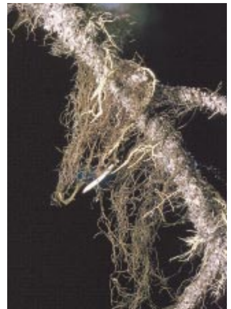
IN LATE WINTER, MOUNTAIN CARIBOU FEED ALMOST ENTIRELY ON ARBOREAL LICHENS.

FOR MORE INFORMATION ON MOUNTAIN CARIBOU, CONTACT: