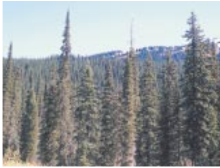
HIGH ELEVATION ENGLEMANN SPRUCE-SUBALPINE FIR STANDS AND PARKLANDS ARE USED BY CARIBOU DURING LATE WINTER, SUMMER AND FALL.