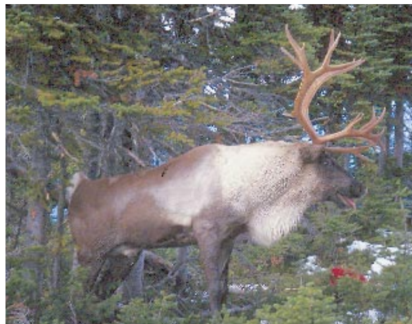
BULL CARIBOU IN SUBALPINE FIR FOREST IN LATE AUTUMN.

extreme north and south ends of the Mountain Caribou's range and those living in highland, rather than