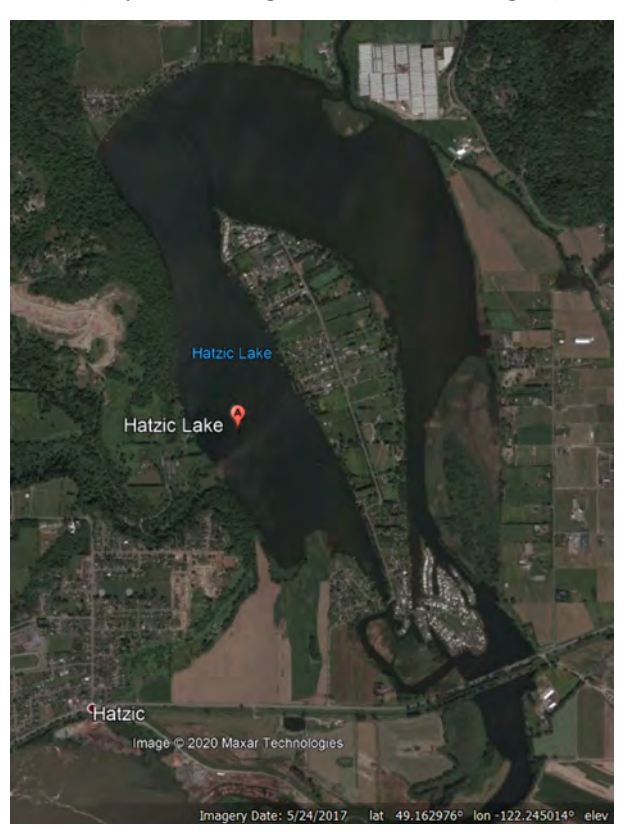
Figure 2 – High Water Levels, Hatzic Lake, May 24, 2017 (Map data: Google, Maxar Technologies)