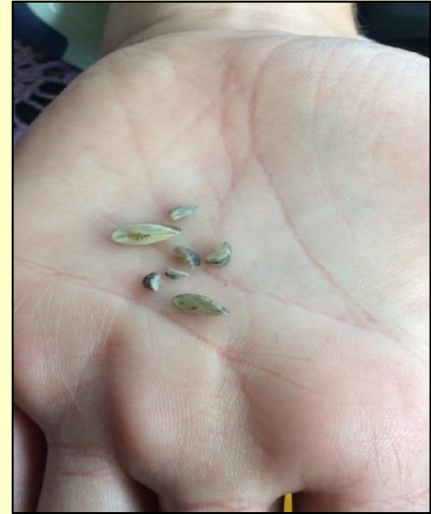
Invasive mussels found on a boat coming from Ontario intercepted at the Golden inspection station on September 23 rd 2016.

March 2017 – Training of mussel inspectors for 2017 season.