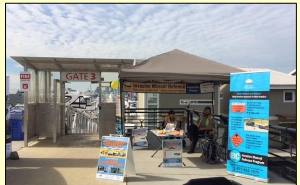
Chilliwack mussel inspectors at the Mosquito Creek boat show in North Vancouver.

82% of the mussel fouled boats intercepted to date have come from Ontario