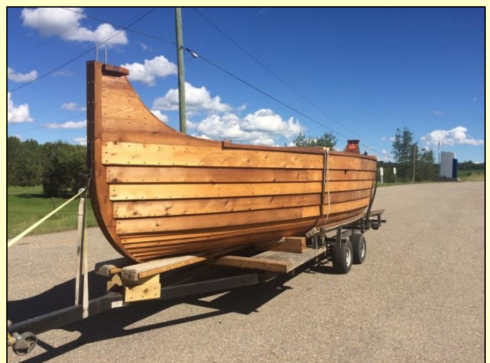
Crews continue to see all types of unique watercraft being transported in the Province.