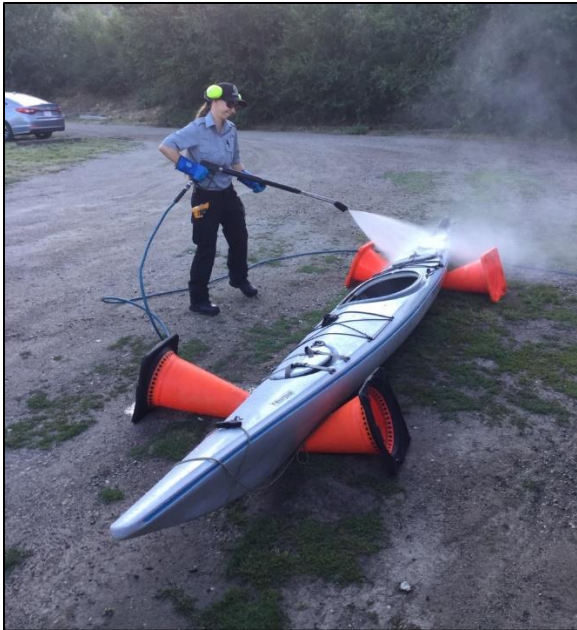
Penticton (top) and Laidlaw inspection crews (bottom) performing decontaminations on high-risk watercraft which includes non-motorized boats such as canoes and kayaks.