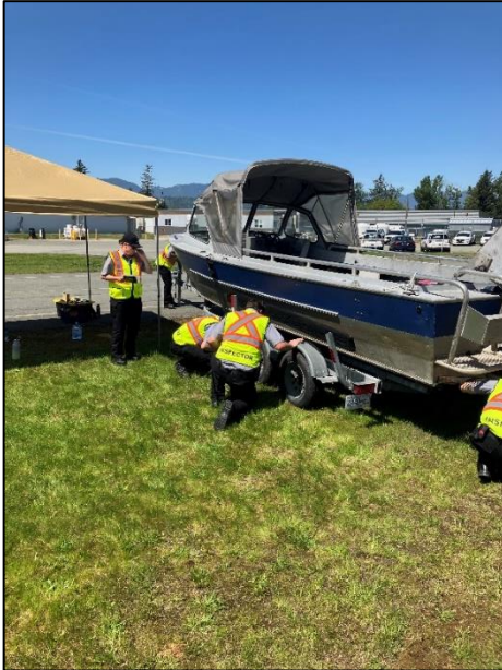
Top and bottom: Aquatic Invasive Species inspectors participating in the May program training at the Pacific Region Training Centre in Chilliwack.