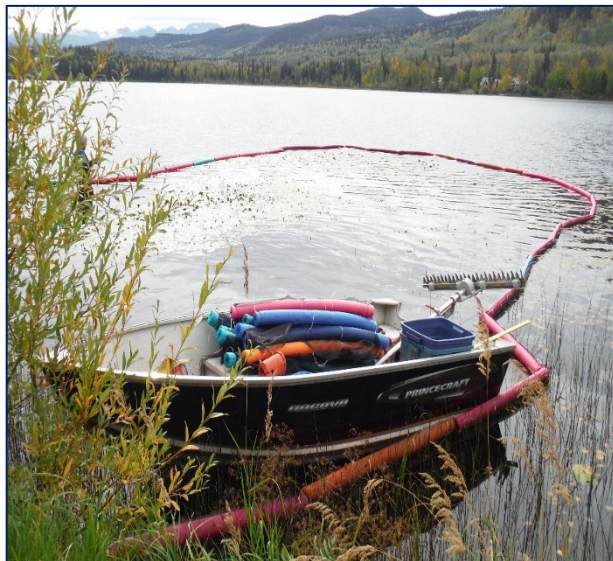
Figure 1. Example floating containment boom around work site.