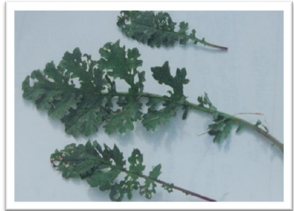
Fig. 4. L. jacobaeae adult feeding damage

In the U.S.A., a cold adapted strain of the Italian biotype was released in 1969 in Calif. but failed to establish. Later, beginning in 2002, attempts were made to establish populations with an additional Swiss biotype. These latter releases were successful in Idaho, Mont., and Oreg. and populations are now rapidly increasing at sites not suited for the Italian biotype 13 .