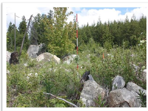
Fig. 7. 2013 Naramata release site (Interior Douglas-fir zone)