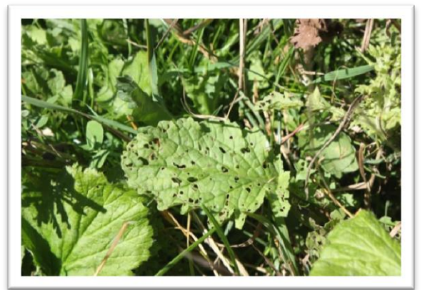
Fig.9. Typical L. jacobaeae adult foliar feeding