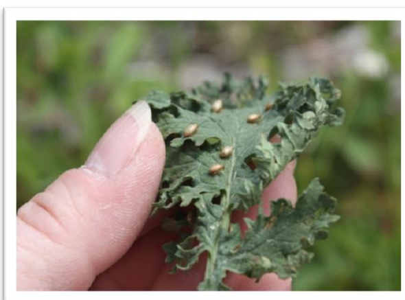
Fig.8 L. jacobaeae adults