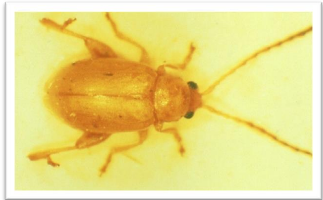
Fig 1. L. jacobaeae adult (credit Powell et. al. 1994)