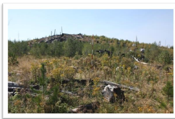
Fig. 6. 2011 Naramata release site (Interior Douglas-fir zone)