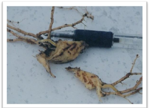
Fig. 5. L. jacobaeae larva feeding damage