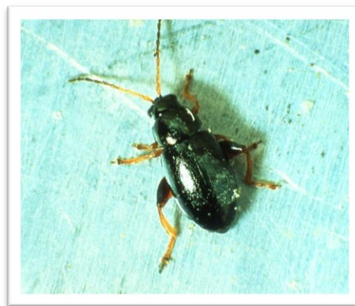
Fig 1. A. lacertosa adult (credit Powell et al.)

Mature larvae overwinter in a pupal cell in the soil.