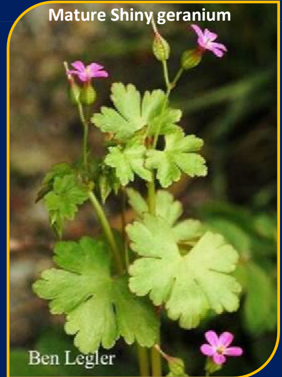
Mature Shiny geranium

For more information: https://www2.gov.bc.ca/gov/content/environment/plants-animals-ecosystems/invasive-species/priority-species/priority-plants