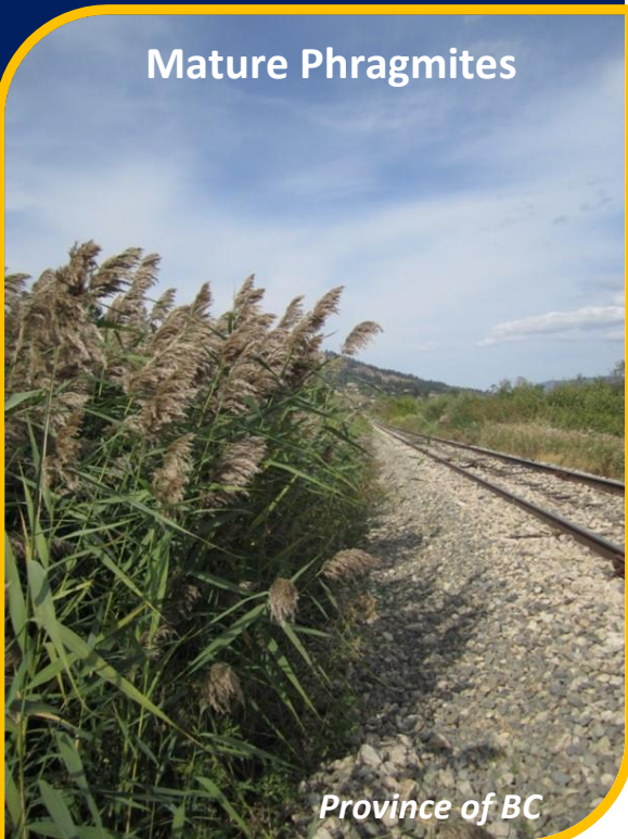
Province of BC