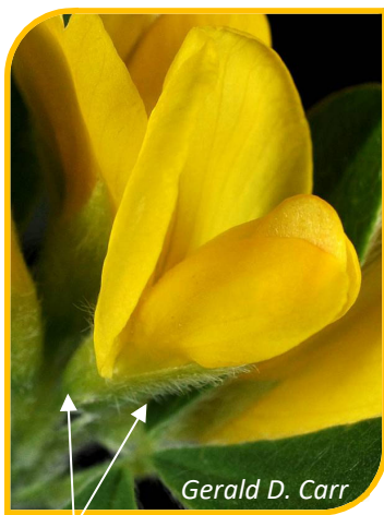
Pea-shaped flower held by a two-part hairy calyx

PRIMARY THREAT: Outcompetes beneficial plants and increases wildfire fuel hazards.