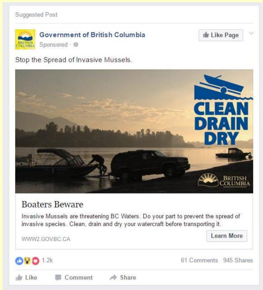
Clean, Drain, Dry Facebook advertisement as part of the online media campaign.

Watercraft inspected to date have been identified as traveling into B.C. from 55 different provinces, territories and states