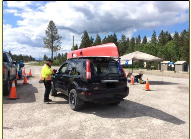
A total of 36 tickets and 29 warnings have been issued to motorists for failing to stop at an inspection station

To date a total of 36 tickets and 27 warnings have been issued to motorists for failing to stop at a watercraft inspection station.