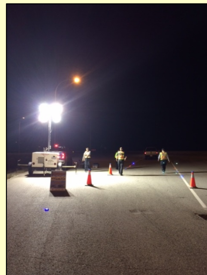
Nighttime inspection trial at the Golden Inspection Station on August 23 rd .