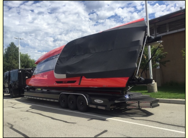
Crews continue to see watercraft being transported in all kinds of unique ways.

Oct 15 th – All remaining inspection stations operations close.