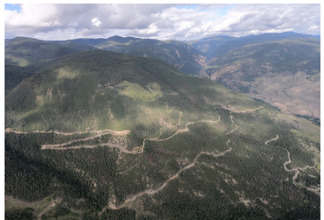
The network of roads adjacent to the slide site.