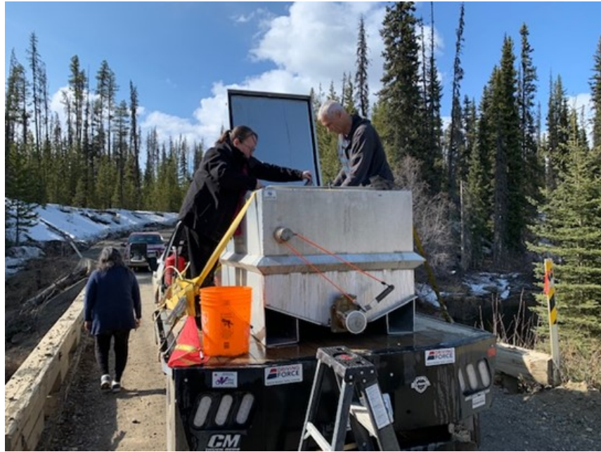
MEMBERS OF NAK'AZDLI FIRST NATION, QUESNEL RIVER RESEARCH CENTRE AND DFO RELEASE FRY INTO SALMON RIVER, APR 26/22

Returns for Chinook and coho are expected to be similar to recent years as impacts from the Big Bar landslide have been significantly less for those salmon species.