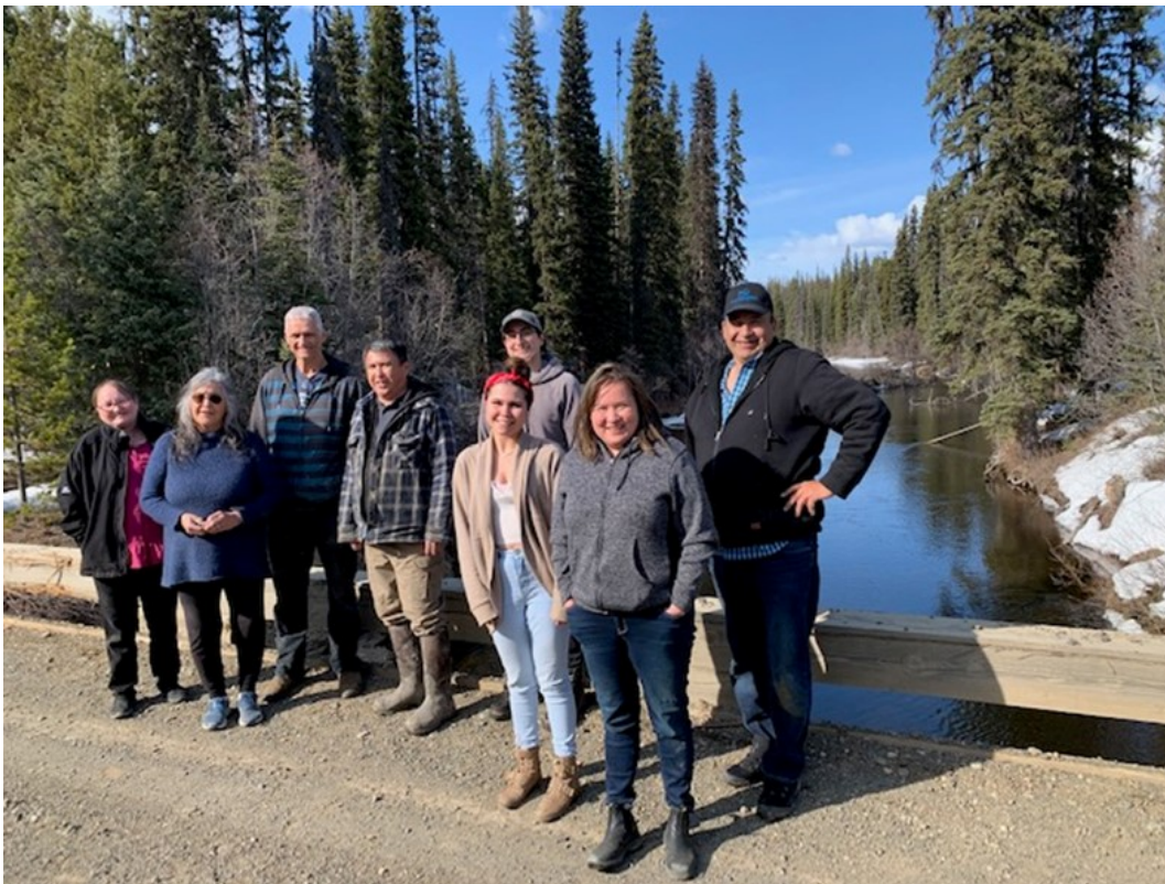
MEMBERS OF NAK'AZDLI FIRST NATION, QUESNEL RIVER RESEARCH CENTRE AND DFO, APR 26/22

To learn more about salmon fry releases and the Big Bar landslide response visit: Big Bar Fry Release Video