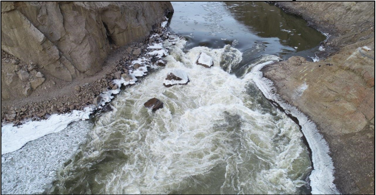
ABOVE: The Big Bar landslide site as seen via drone, December 2019.