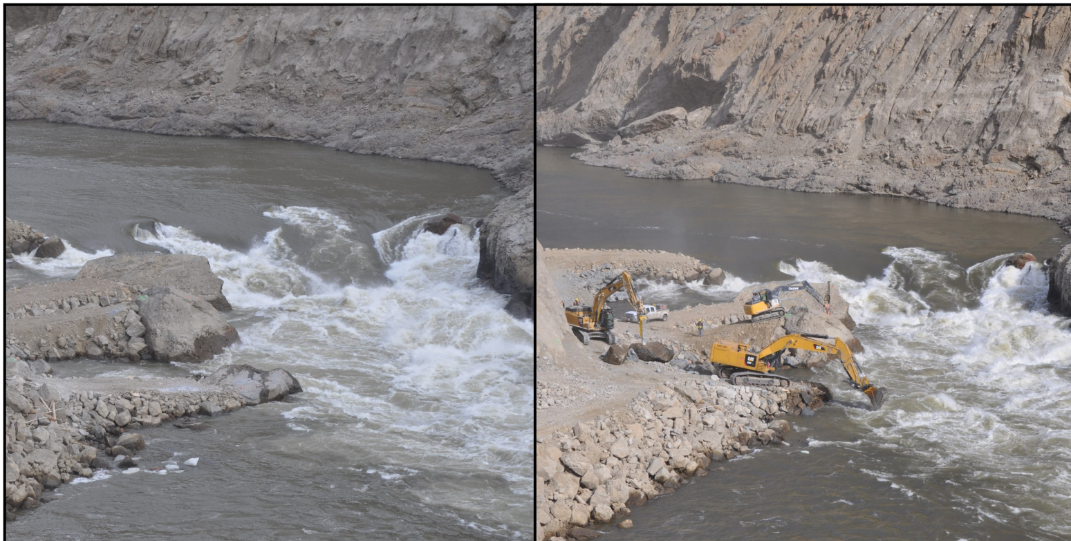
PICTURED: (left) Boulder D7 before blast (right) After D7 blast