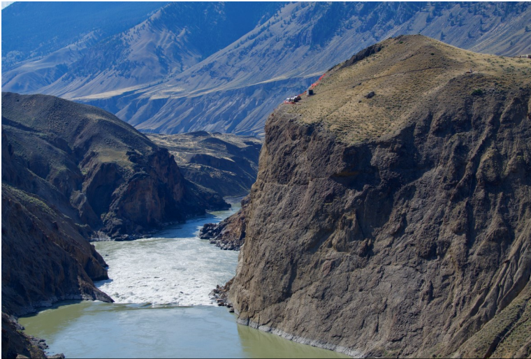
Big Bar Landslide with scaler site.