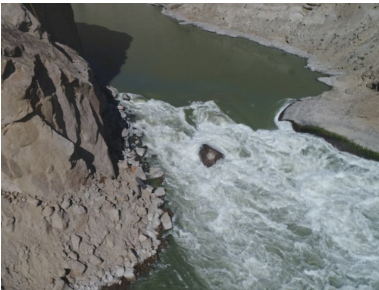
Big Bar Landslide overhead shot showing large boulder mid-river during low river level.