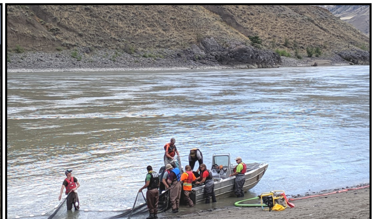
Beach seining crew bringing in the fishing net.