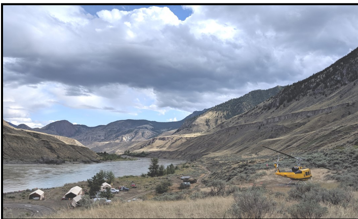
Staging area near the site of the incident.