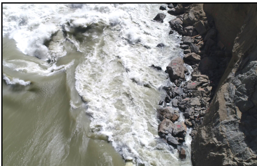
Progress on the natural fish passage can be seen on the righthand side.