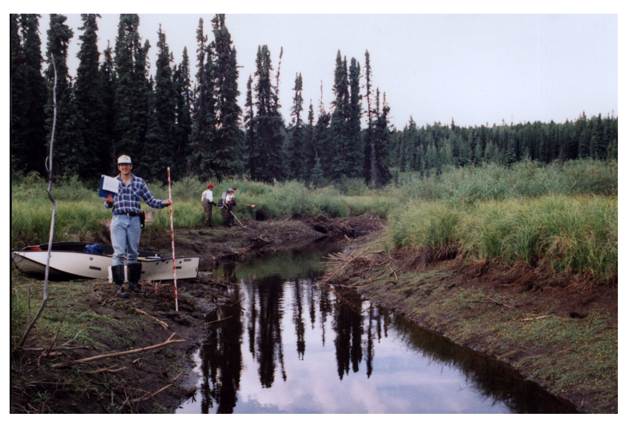
Figure 2: Example of a stream with large channel morphology.

Other examples of large channel morphologies can be seen in the wash material supply dominated and transitional phases of Figure 1, and in Figure 2.