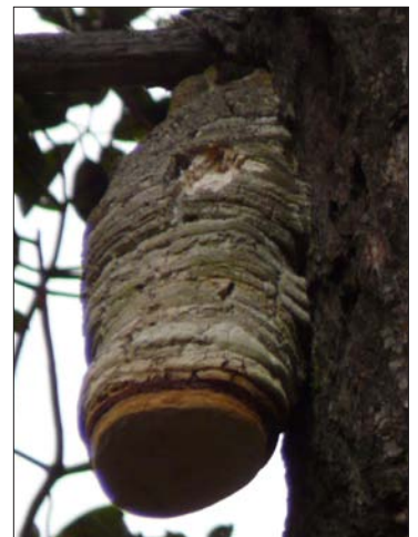
Brown trunk rot (Fomitopsis officinalis)