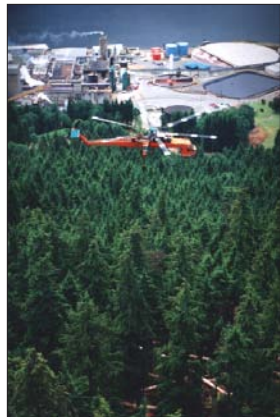
Heli-logging with ground crew is LOD-4

Activities that are considered to cause very high levels of disturbance (LOD-4) include: