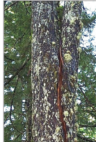
Split trunk with advanced rot

Split trunk – deep cracks (extending >25% of tree diameter into stem) with internal decay.