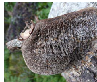
Brown stringy trunk rot a.k.a Indian paint fungus ( Echinodontium tinctorium ) look for them at branch stubbs

Thick sloughing bark – for thick barked species (especially Douglas-fir, Larch, Cottonwood), consider loose slabs shedding from the stem.