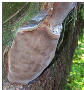
White trunk rot (Phellinus hartigii) conk, also on stem, wind failure risk