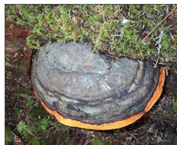
Brown crumbly rot, serious on dead trees (Fomitopsis pinicola)