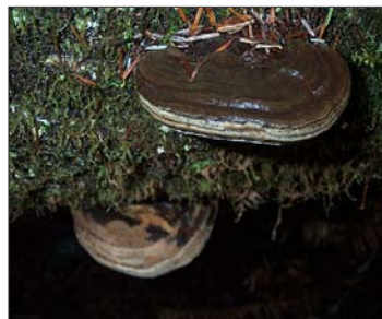
White mottled rot ( Ganoderma applanatum ) conk