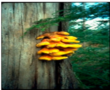
Brown cubical rot ( Laetiporus conifericola )

Conks or mushrooms – assume that heart rot conks are dangerous indicators of advanced internal decay, unless trained to identify Phellinus pini or Phellinus tremulae conks and you know how to apply safe work procedures for these fungi. Mushrooms on the lower bole or roots of the tree might indicate root disease. Saprot fungi is dangerous when seen on small diameter (<30 cm) stems or tops.