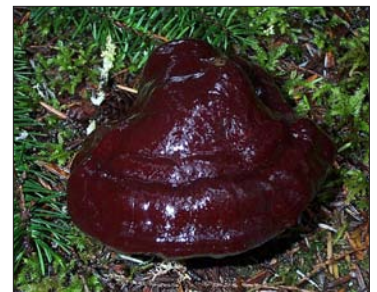
Lacquer fungus (Ganoderma oregonense) conk