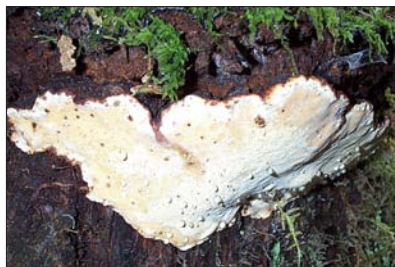
Annosus root and butt rot, rarely seen,