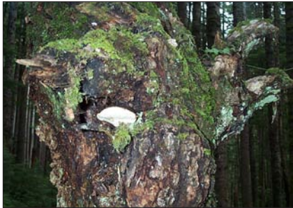
Mistletoe stem goiter with heart rot conk

Hazard top – dead tops and secondary tops are particularly dangerous where there are visual signs of weakness (e.g., splits, cavities, shrubs growing out of forks, conks, signs of advanced rot). Snags with weak tops are also dangerous where >20% of the tree height is an unstable top (30% for Douglas-fir, spruce, pine or larch).