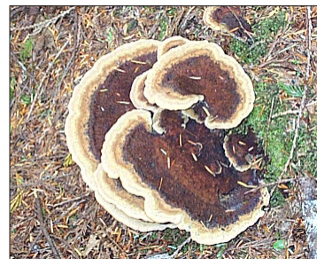
Butt rot ( Phaeolus schweinitzii ) | Armillaria root disease mushrooms, conks can be on the ground or on tree | also found on tree's stem