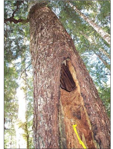
Stem damage with obvious signs of advanced decay - bore for shell thickness