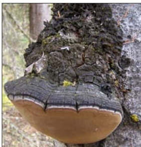
Aspen trunk rot (Phellinus tremulae)

There is a high risk that defect trees will fail under very high levels of disturbance (LOD-4), and for this reason, most trees with structural defects are dangerous for LOD-4. The exceptions are cedars. To be considered safe, however, a defect cedar can only have superficial damage with no evidence of decay in the surrounding stem wood. Roots must have no visual stability problems, and damage can affect no more than 25% of the support roots. Lean must be minimal with no sign of rooting problems (disease, damage, lifting mat, or unstable soils). If these conditions are not met, the cedar tree is dangerous.