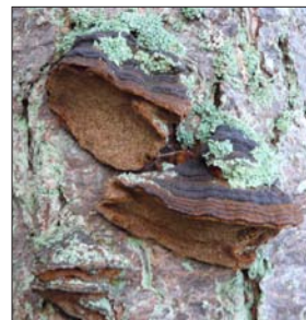
Red ring rot conk (Phellinus pini)