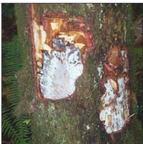
Armillaria root disease confirmed | found under root flares by white mycelial fan under bark | (Heterobasidion annosum)