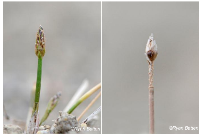
Figure 3 Early and late season spikelets of Eleocharis engelmannii