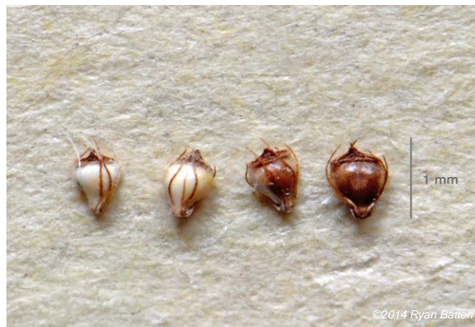
Figure 6 Eleocharis engelmannii achenes showing colour variation