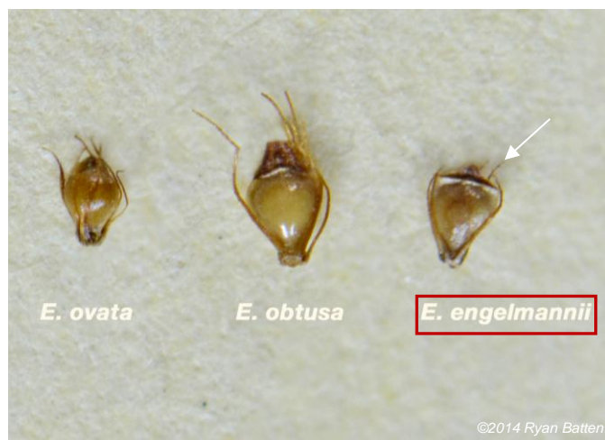
Figure 5 Comparison of mature Eleocharis achenes showing perianth bristles (arrow)