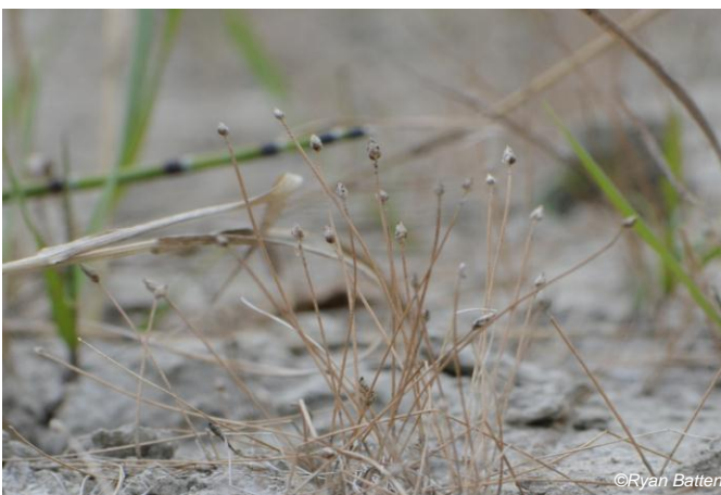
Figure 2 Late season senescing plants in drainage channel