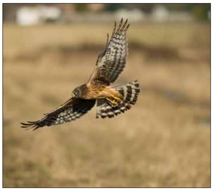
Identification (Length 41–58 cm; Wingspan 97–122 cm)