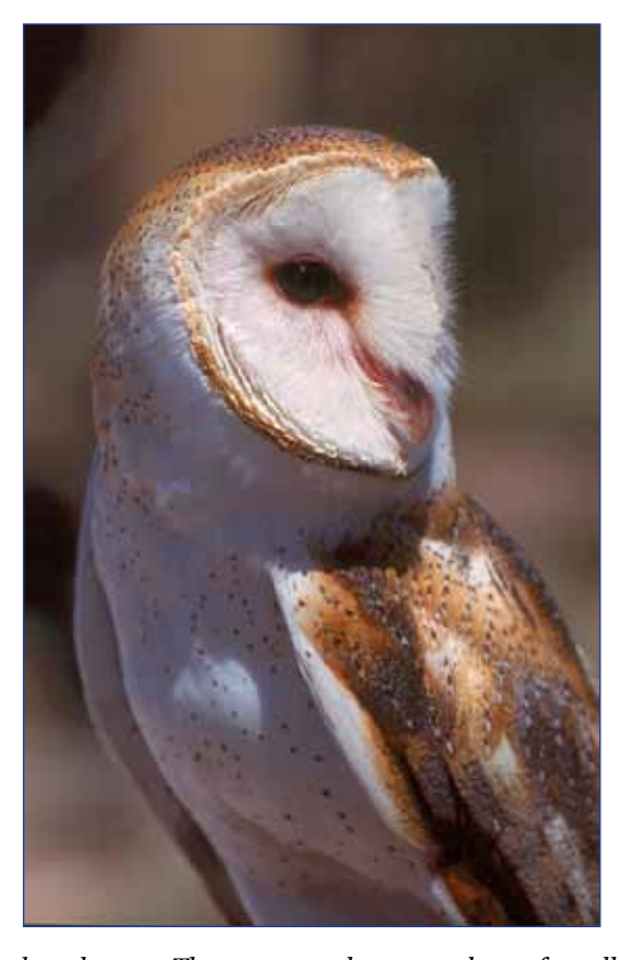
Barn Owls often nest in old farm buildings in agricultural areas. They consume large numbers of small mammals such as voles, mice, rats, and shrews.