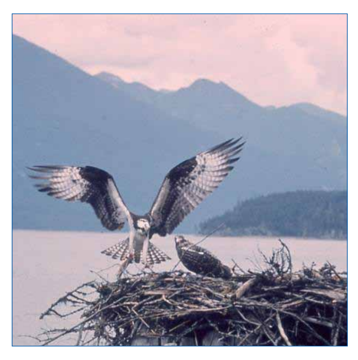
Osprey and nest.