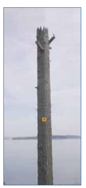
Raptor perch created from topped tree