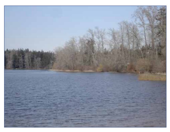
Fish-bearing lakes, large trees near the shoreline, and coniferous woodlands provide raptors and their prey with important habitats.

Falcons, hawks, vultures, and eagles are active primarily during daylight hours, whereas owls are mainly active at night. However, there are exceptions to this pattern, since the Northern Pygmy-Owl, Northern Hawk Owl, Snowy Owl, and Shorteared Owl may be seen during the day.