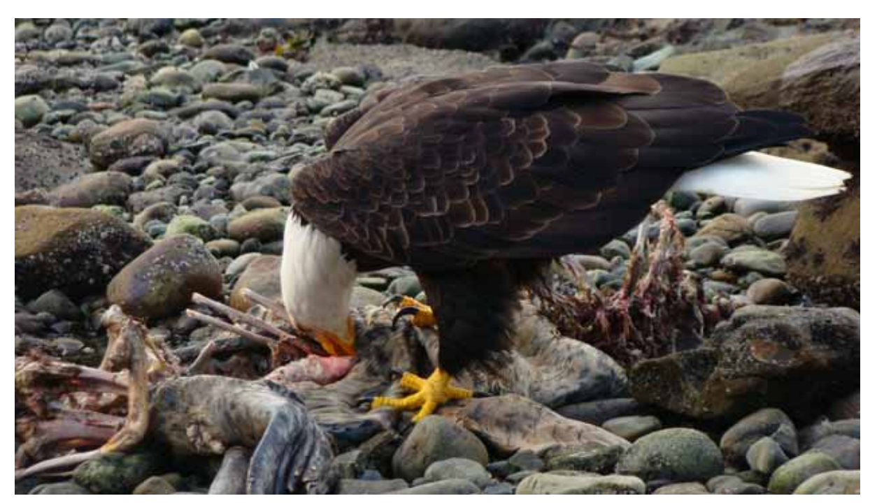
Bald Eagle feeding on seal carcass.

Some serious threats to raptors occur outside the province during migration and on wintering grounds; these threats are beyond the control of management efforts in British Columbia. For instance, a catastrophic loss of Swainson's Hawks occurred in Argentina (up to 5% of the worldwide population), as a result of pesticide use to control grasshoppers which form a major part of their winter diet. However, many raptors migrate through and winter in British Columbia where they are subject to a degradation of wintering and staging habitats, which can reduce their survival and ability to migrate and breed successfully. Being top predators in the food web, raptors are also very susceptible to pesticides, particularly to contamination by heavy metals and other chemicals that accumulate in their bodies. They are also susceptible to alterations of winter foraging habitat, harassment and poaching. Some migratory songbirds and shorebirds are also threatened by the degradation of wintering areas. Reduction in numbers of smaller birds affects the food supply of those raptors that feed on them.