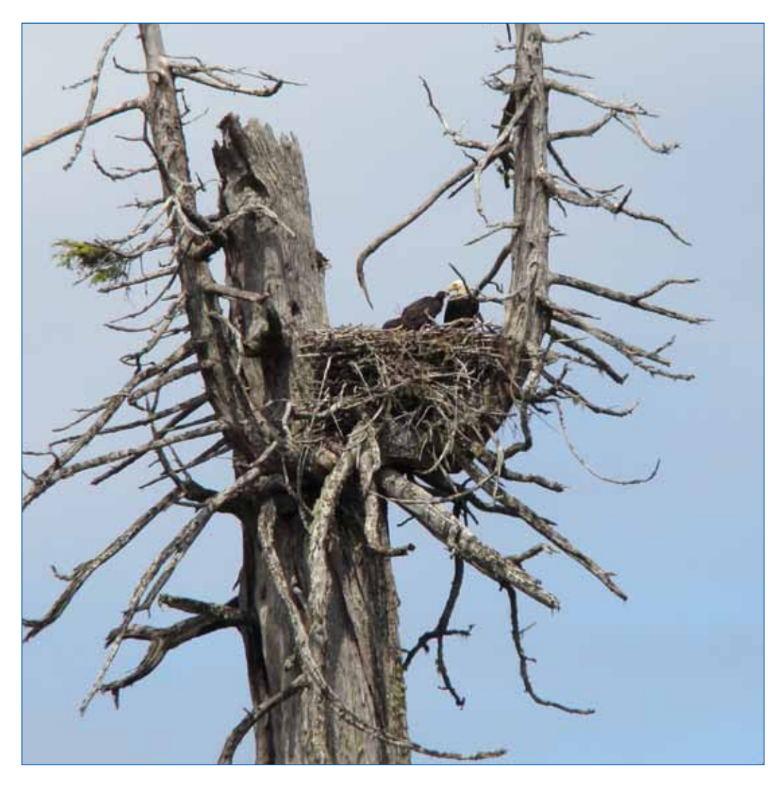
Nesting Bald Eagle with young.