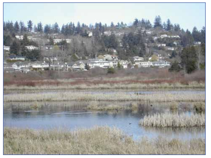
Wetlands, shrubs, conifers and deciduous trees provide important habitats for raptors and their prey in urban environments.