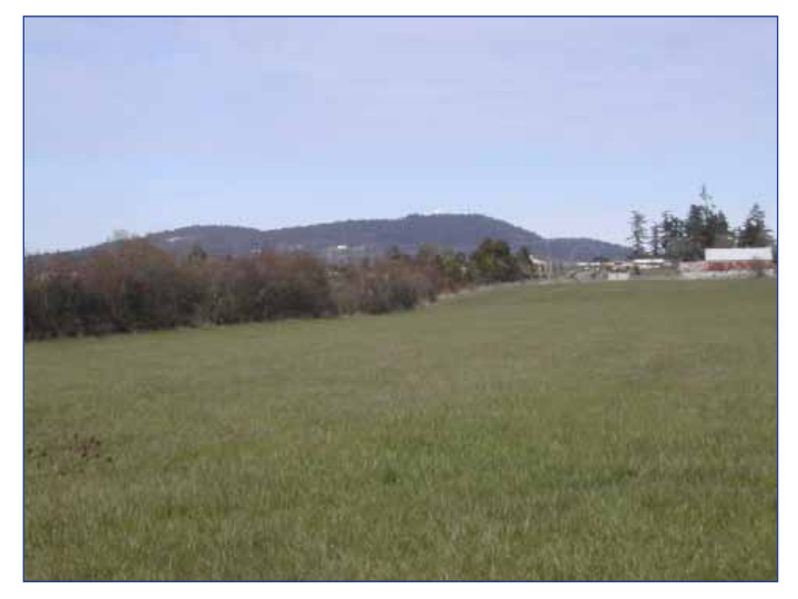
Fields or pastures, hedgerows, and tall trees in urban areas are commonly used by raptors.

An expanded summary of provincial and federal legislation relevant to raptor conservation is presented in Appendix A .