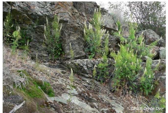
Figure 3 Group of Thelypodium laciniatum growing at base of rocky cliff near Oliver, B.C.