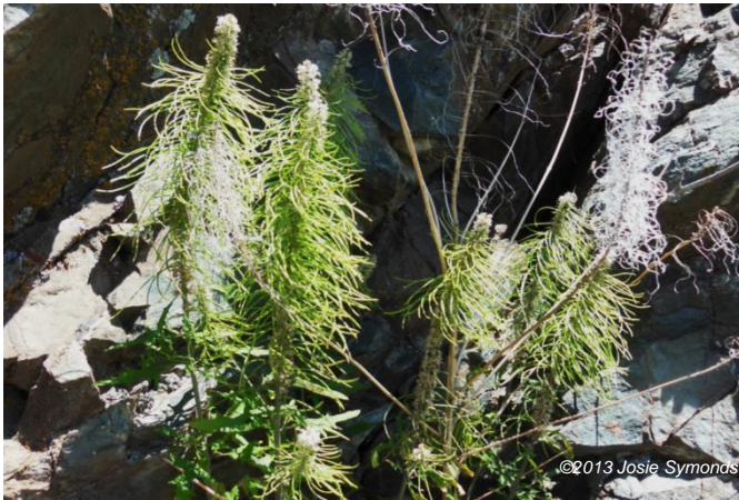
Figure 5 Mature plants showing live and previous years' stalks