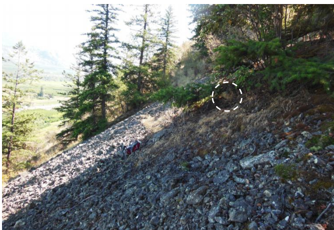
Figure 2 Dry, talus slope habitat south of Oliver, B.C.