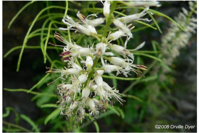
Figure 6 Close-up of dense inflorescence showing green-white sepals, white spoon-shaped petals, and long siliques in background