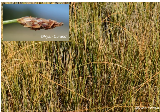
Figure 5 Close-up of a patch of Eleocharis rostellata with numerous arching culms; inset shows close-up of a flowering spike