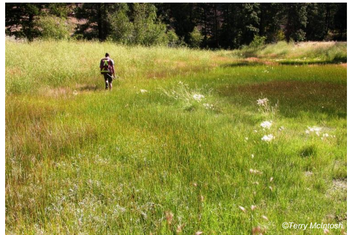
Figure 3 Saline meadow habitat north of Oliver, B.C.