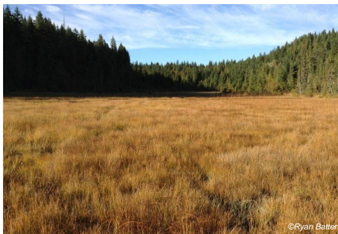
Figure 2 Calcareous wetland habitat near Salmon Arm, B.C.