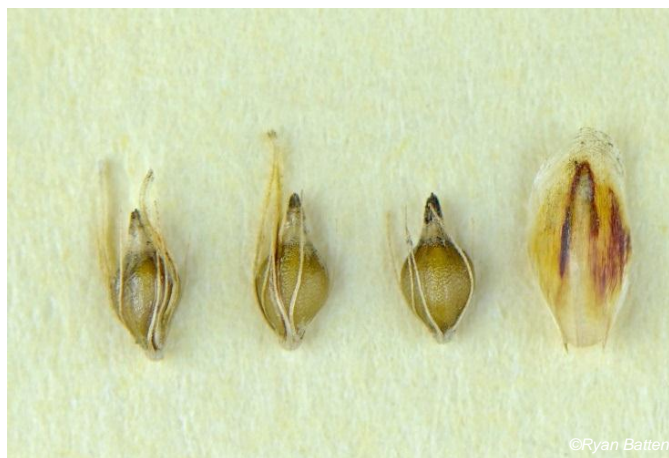
Figure 6 Mature achenes (left) with relatively long perianth bristles and steep-sided tubercles, and a single flowering scale (far right) with blunt tip and clear margins