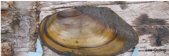
Figure 7. Anodonta nuttalliana .