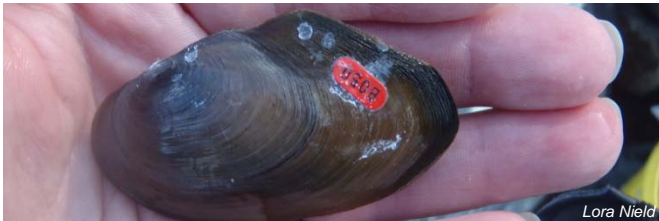
Figure 6. Tagged Anodonta nuttalliana from Skaha Lake, B.C.