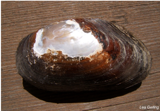
Figure 4. Anodonta kennerlyi from Okanagan Lake, B.C.

A. kennerlyi is elliptical or elongate in shape (length to height ratio is near or >2 ). The beak (raised, rounded area) does not project or barely projects above the hinge line. It is laterally inflated (fat) primarily along the posterior ridge (the end farthest away from the beak) region. Shell is yellow to brown in colour and smooth and shiny. The nacre is white or blue-white with some pink toward the centre.