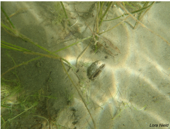
Figure 2. Silt habitat in an aquatic plant bed in Skaha Lake, B.C.