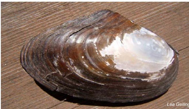
Figure 8. Anodonta nuttalliana from Okanagan Lake, B.C.

A. nuttalliana is elliptical or ovate in shape. The top margin is raised to form a “wing” (length to height ratio is <1.5 ). The shell is olive, yellow, red-brown or black. Nacre is white or sometimes pink or blue.