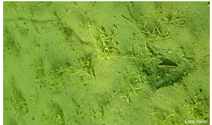
Figure 3. Silt habitat in Okanagan Lake, B.C.