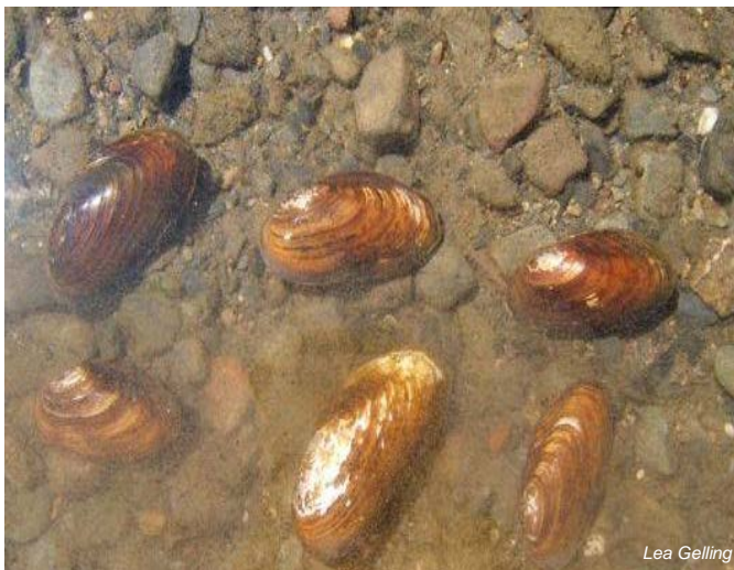
Figure 5. Anodonta sp. in Summit Lake, B.C.

A. oregonensis is elliptical in shape (length to height ratio is near or >2 ). The shell is light to dark brown and smooth and shiny. The nacre is white. The beak does not project above the hinge line and it is laterally inflated (fat) primarily along the median region.