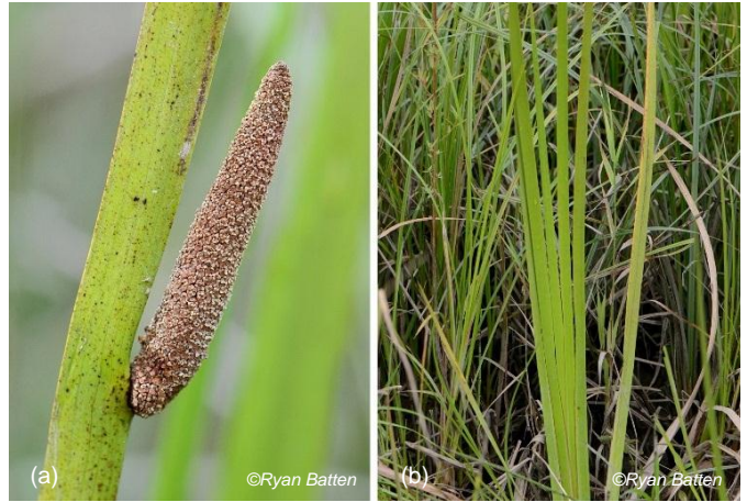
Figure 6 Close-up of (a) spike-like inflorescence and (b) leaf arrangement of a non-flowering individual