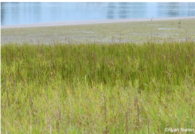
Figure 2 Plants (dark green band) above mudflat habitat beside lake