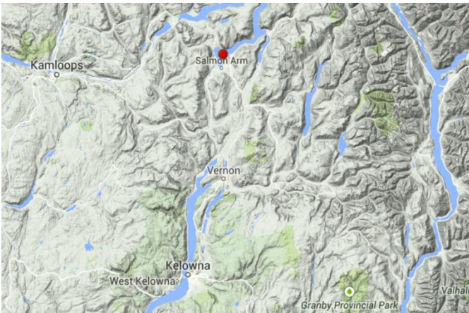
Figure 1 Thompson Okanagan Region distribution of Acorus americanus (BC CDC 2014)