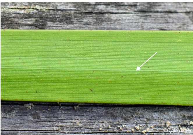
Figure 5 Close-up of leaves showing midvein (arrow) that is almost flush with the surface of the leaf