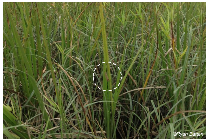
Figure 3 Wetland fringe habitat along Pitt River with reed canarygrass ( Phalaris arundinacea ) and large sedges; photo depicts one of few flowering individuals in population (inflorescence circled)