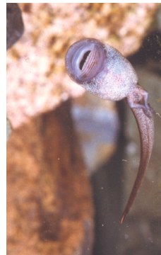
Tailed frog tadpoles have a unique sucker mouth to anchor themselves to rocks in fast flowing streams