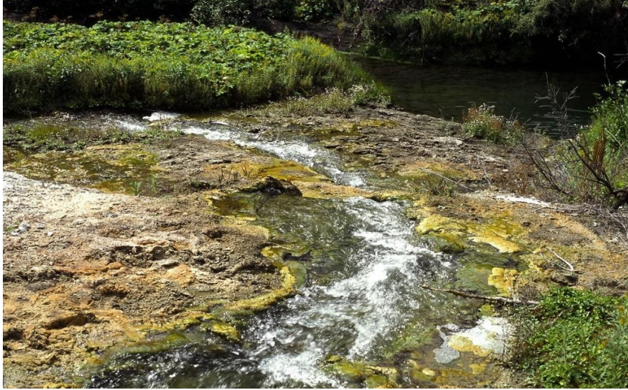
Figure 48. Hot spring.

A hot spring or thermal spring means a source of water that is heated geothermally and comes to the surface as a seep or forming a pool of unspecified size or temperature (Figure 48).