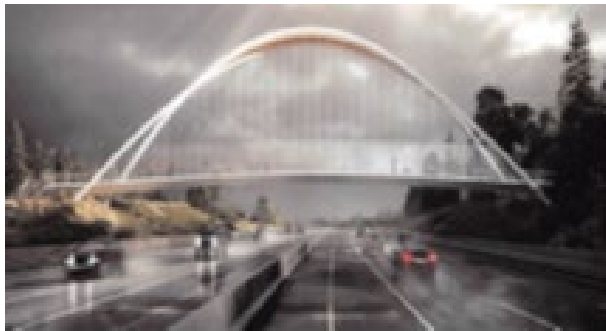
Lake Burnaby Ped. & Bike. OH – Hwy 1, Burnaby – Fall 2023 construction –