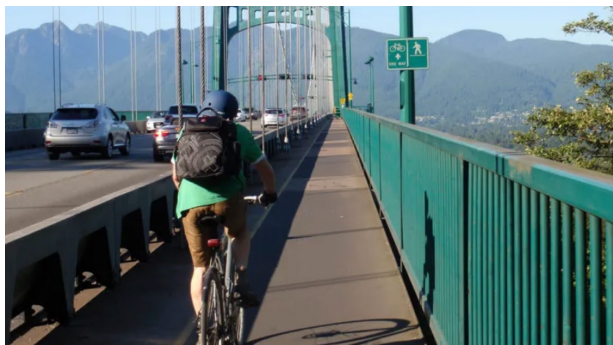
Lions Gate Bridge – Hwy 1A/99, Vancouver