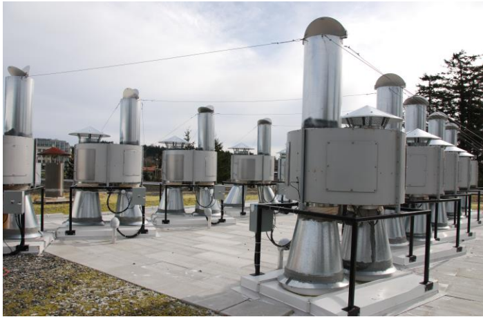
Victoria Regional Laundry – Dryer Heat Recovery Project $210,000 – Custom Retrofit Program Incentive