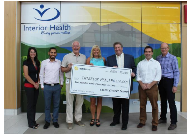
Interior Health $250,000 – Commercial new construction & retrofit programs

Incentives paid: $9,000,000+ 17,000+ tonnes CO2 Reduced