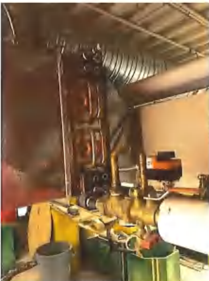
New coil and controls (Mount Sentinel)

Each year, the Board updates its Capital Plan that outlines various facilities and transportation initiatives to reduce the district's carbon footprint. We install LED lighting, upgrade building envelopes, replace or improve mechanical systems, all to reduce emissions. Building retrofits aim to reduce the district's carbon footprint, increase efficiencies, and reduce operating costs. The following building designs and retrofits were completed in 2023-2024: