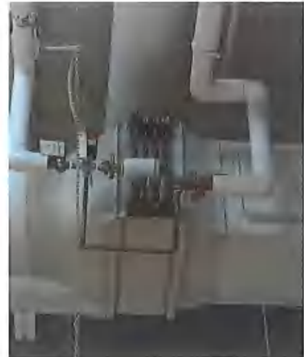
New coil and controls (Trafalgar)

By June 30, 2024, the School District No. 8 Kootenay Lake's final 2023 Climate Change Accountability Report will be posted to our website at www.sd8.bc.ca