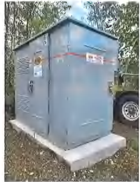
New charging kiosk (Nelson bus yard)