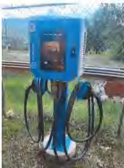
New charger (Nelson bus yard)

As fleet vehicles are replaced, the district plans to acquire EV, PHEV, or hybrid vehicles. The district is awaiting delivery of three new electric buses bringing our electric bus fleet to five.