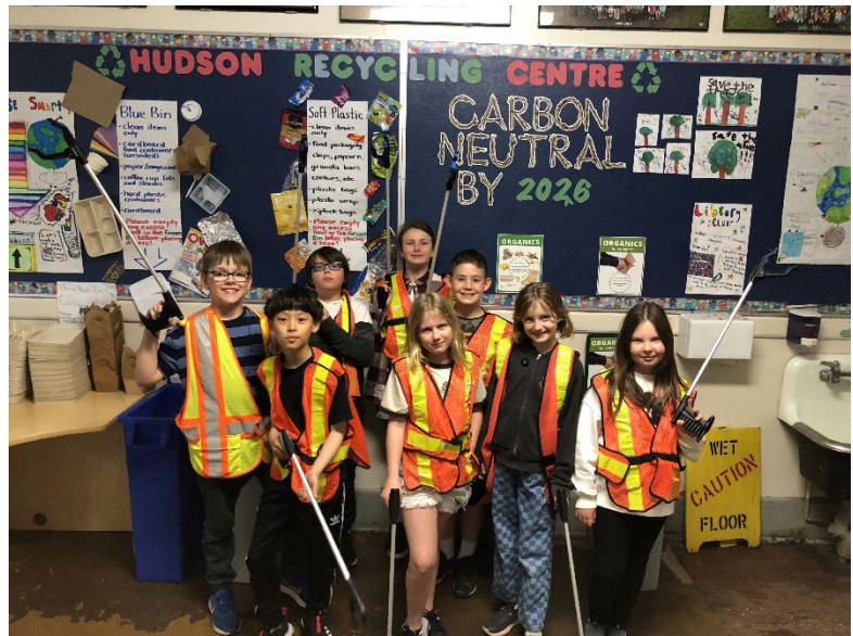
Students from Hudson Elementary started a recycling club with their sustainability grant funds.