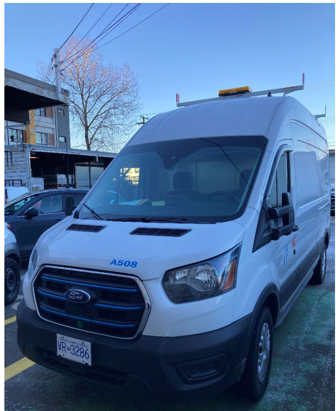
The District's newest electric fleet vehicle will be delivering lunches to students every day.