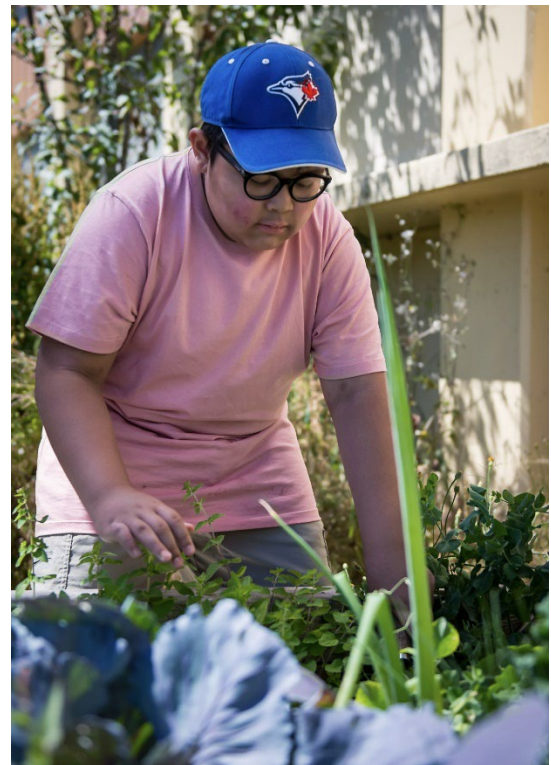
A student in the garden at Vancouver Technical School

The District is proud to maintain its commitment to promoting sustainability within our schools and our community. We will continue to reduce energy use and our GHG emissions. We continue to build on past efforts and work to incorporate sustainability into all aspects of our operations.