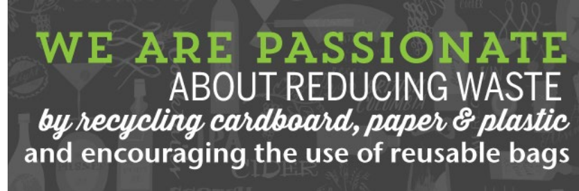
Sample sustainability signage at BCL stores to encourage customers to use reusable bags.

In addition to promoting the use of reusable bags, in-store signage encourages customers to return empty containers for recycling. Every year, over 93 million empty beverage containers are returned to BCL stores across the province, facilitated through return counters available in each location.