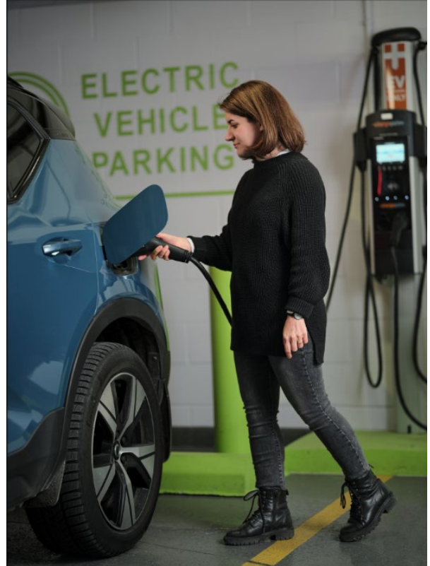
Light duty fleet vehicle being charged at LDB's head office.

3,851 litres and emitting 43 per cent less greenhouse gas emissions over the previous year. The reductions were achieved by operating the current fleet of six ZEV light duty vehicles.