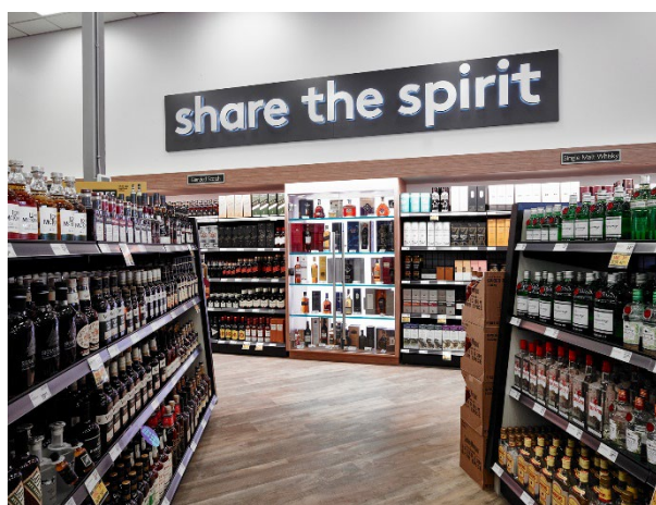
BCLIQUOR store with LED lighting and flooring that does not require floor wax.